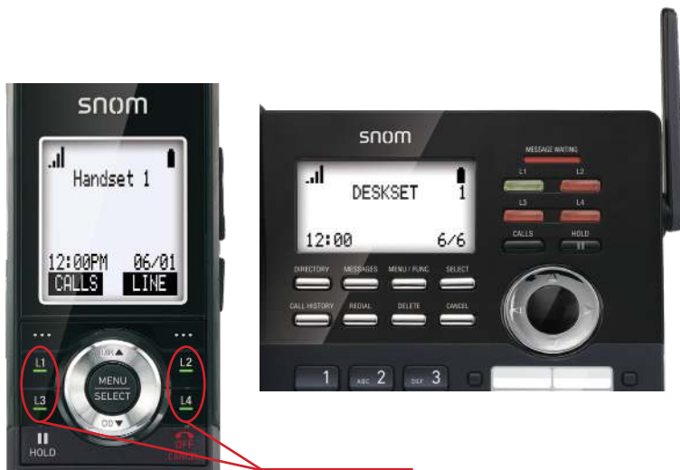
4 LED Line Keys