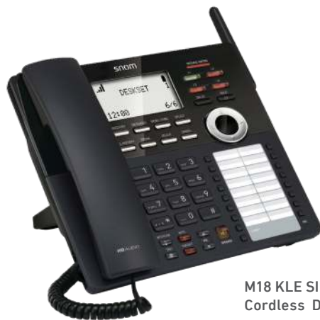
M18 KLE SIP DECT Cordless Deskset