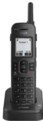
M10R KLE Rugged Cordless Handset