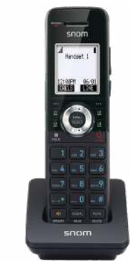
M10 KLE SIP DECT Cordless Handset